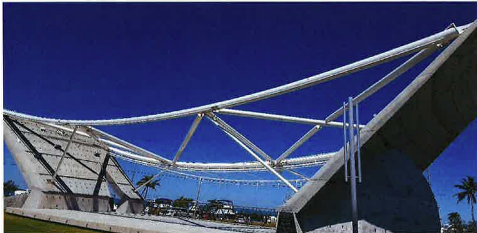
Figure 2: PVC Membrane of Amphitheater