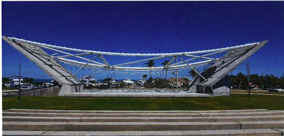
Figure 1: Front View of Amphitheater